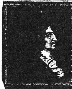
King Louis XIV, a man who loved high heels

crime for anyone other than the privileged classes to wear high-heeled footwear.